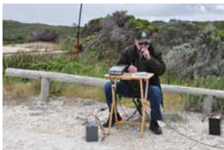
Col VK5HCF operating from the Canunda National Park.