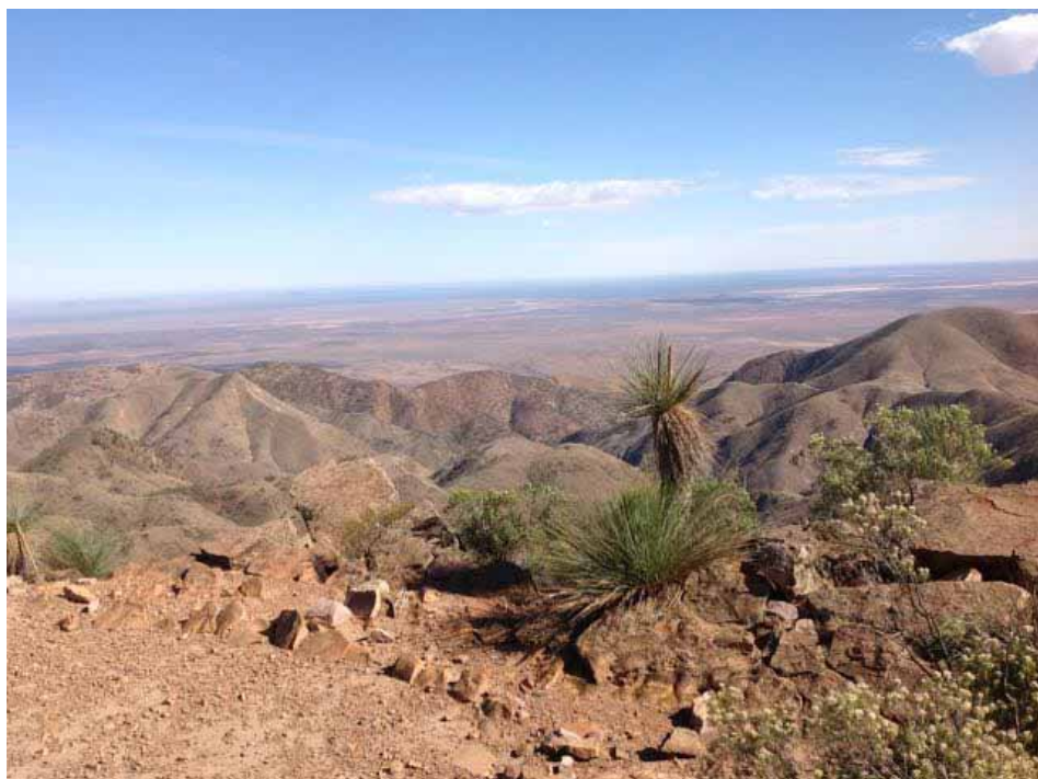
SOTA, VK5 PARKS AWARD, WWFF, PORTABLE, QRP, PEDESTRIAN MOBILE

Welcome to the second edition of ' Out and about in VK5 '.